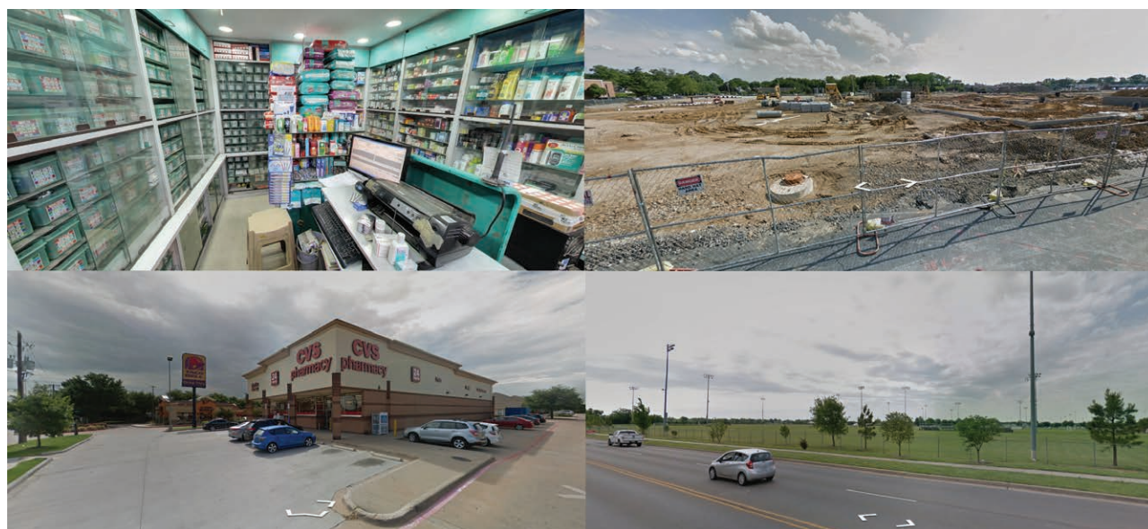
Figure 2. Examples of unreliable reported locations. The figure depicts examples of unreliable locations declared by 4 publishers (2 pharmacies on the left; a work area and a football pitch on the right), as assessed through Google Maps and 3D street view. 3D indicates 3-dimensional.